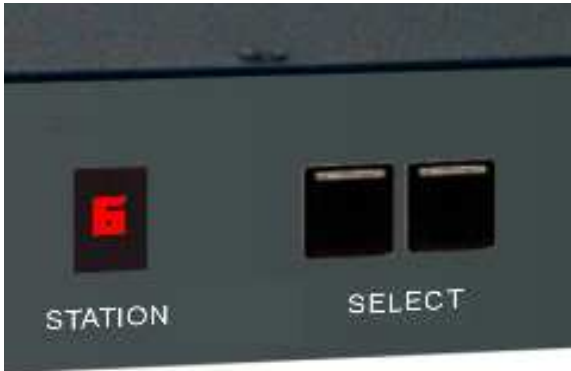
Figure 3. Front Panel

The select buttons sequentially select (scroll up or down) which DVI input signal to route to the DVI output. The station indicator shows which DVI input port is selected.