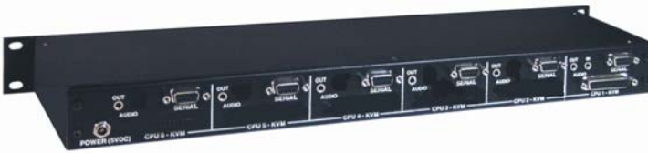
Rear View (video, serial/audio splitter)