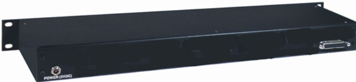
Rear View (video splitter only)