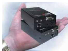
Small in size, loaded with features

The Serial/Audio model allows stereo audio to be transmitted in either direction across the CAT5 link simultaneously. Many serial devices like a Touchscreen can plug directly into the serial port on the Remote Unit. The Mini model is small in size but loaded with state of the art technology. It is ideal for extending the distance between a CPU and a KVM station (up to 150 feet).