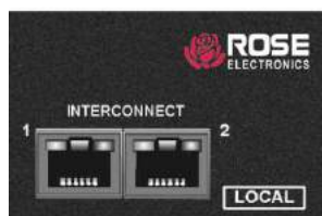
Uses standard CATx cable up to 150 feet

* CATx cable = CAT5, CAT5e, CAT6, or higher