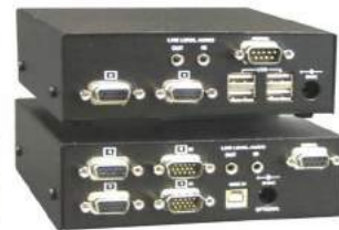
Dual Video w/serial-audio