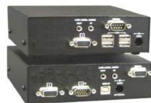
Single Video w/serial-audio