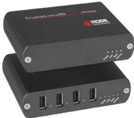
Part Number CLK-4U2TP-100M