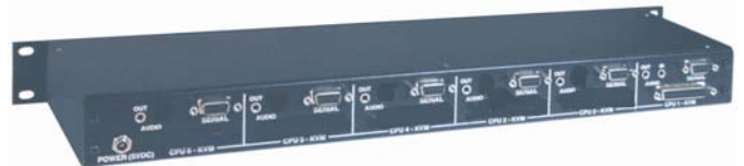
Rear View (Serial/Audio model)