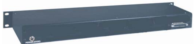
Rear View (Video only model)